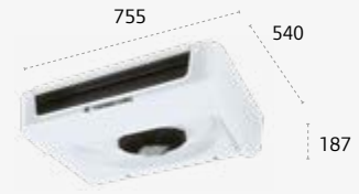
ES150 ULTRA SLIM