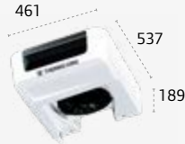
ES100N ULTRA SLIM